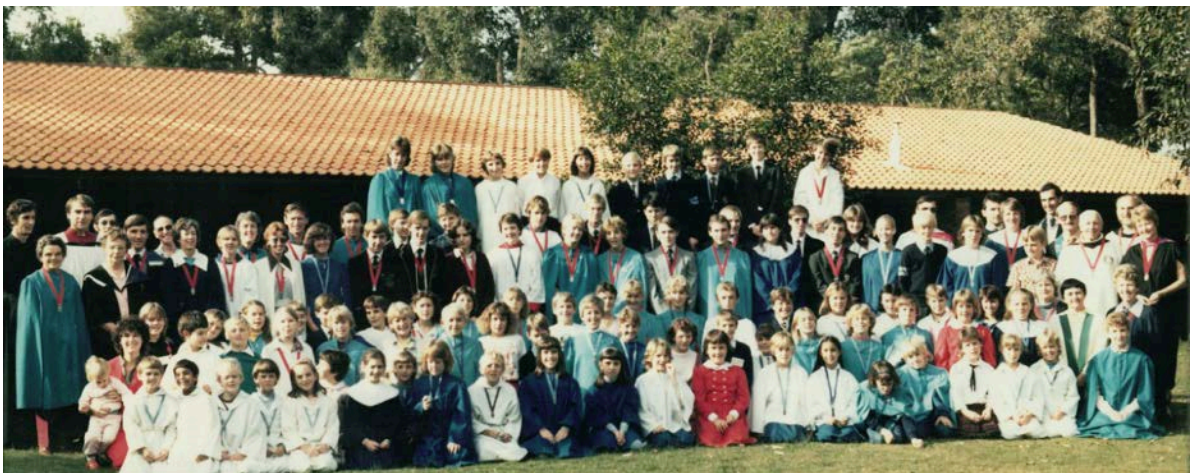
Bunbury Choristers' Camp 1985