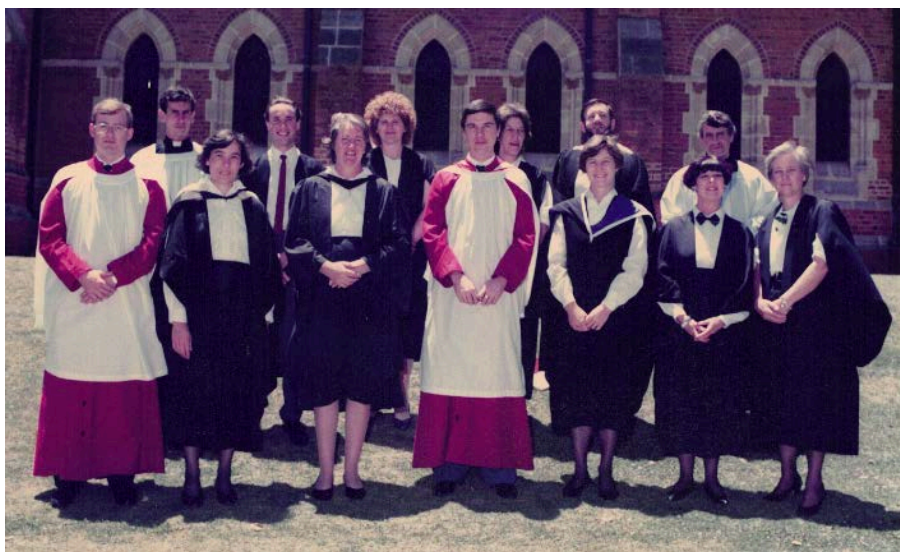
St Georges Choir