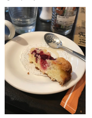
—- and got free cake!!

Following a quick coffee at Starbucks we had dinner at the 'La La Café - They have a piano and a guitar and invite patrons to play/sing—then they give you free cake!! We sang Mozart's 'Ave Verum'