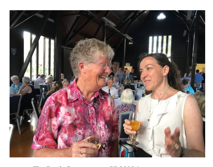
The Perth Contingent at SS 2018!