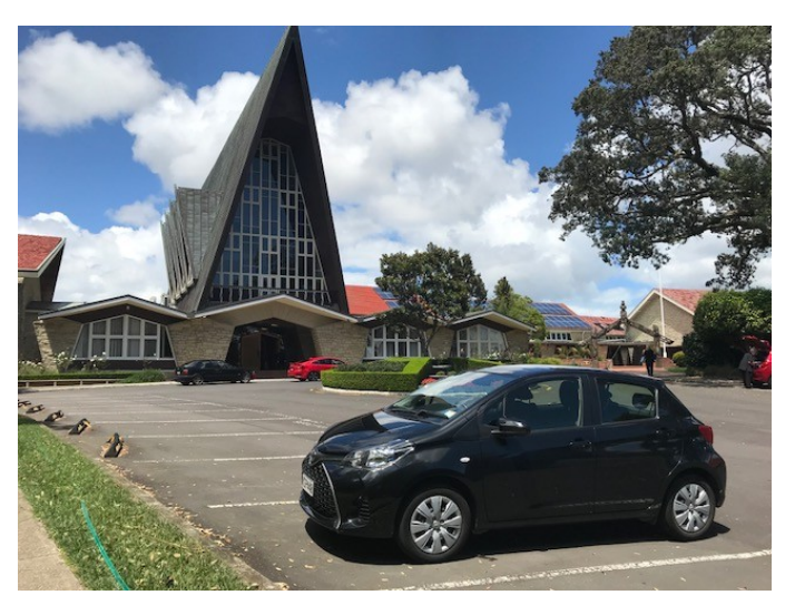
The Dilworth School where the Summer School was held. Very impressive facilities with a beautiful chapel—and the food was great. Hey — is that a little Batmobile in front of Dilworth???