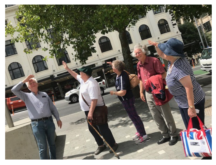
We had a bit of free time so a few of us went to the Auckland Tower—but first we had to find it! Here are a few of us looking for the Tower.