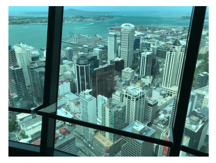
Wow—what a great view. The observation deck is around 200 metres above sea level, and apparently Auckland geologically sits on 50 volcanoes!!

Following a quick coffee at Starbucks we had dinner at the 'La La Café - They have a piano and a guitar and invite patrons to play/sing—then they give you free cake!! We sang Mozart's 'Ave Verum'